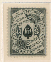
5c black on old paper