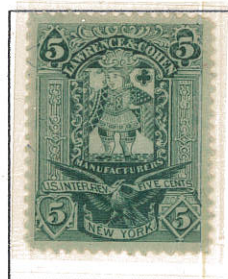
5c green on silk paper