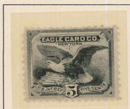
5c black on watermarked paper