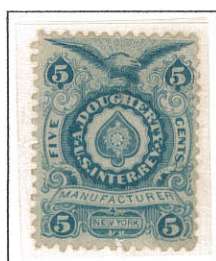
5c blue on old paper