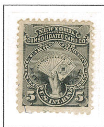
5c black on silk paper