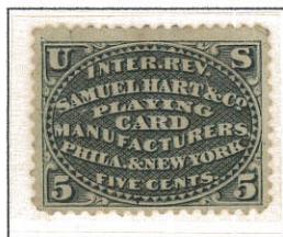
5c black on silk paper