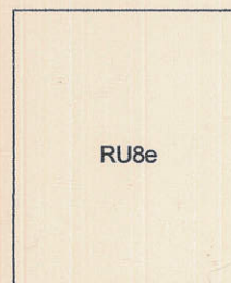
5c black on experimental silk paper