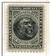
5c black on watermarked paper