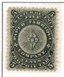
5c black on silk paper