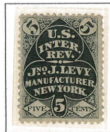
5c black on silk paper