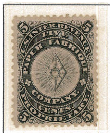
5c black on pink paper