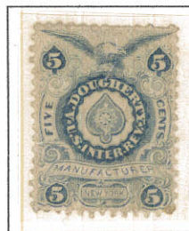
5c ultramarine on experimental silk paper