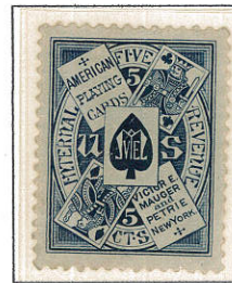
5c black on watermarked paper