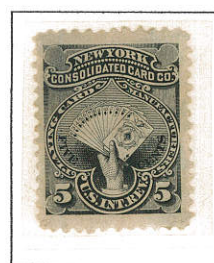
5c black on watermarked paper