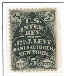
5c black on old paper