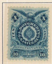
10c blue on old paper