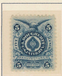
5c blue on watermarked paper (18x23 mm)