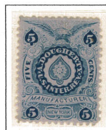
5c blue on pink paper