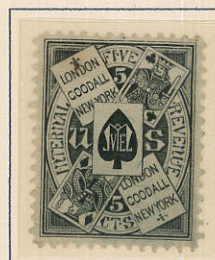
5c black on silk paper