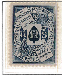
5c black on pink paper