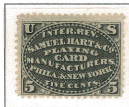
5c black on old paper