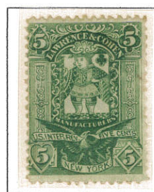
5c green on experimental silk paper