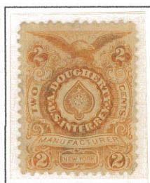
2c orange on old paper