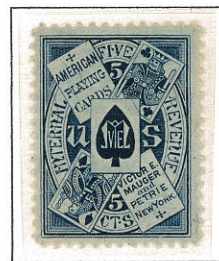
5c black on silk paper