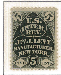
5c black on experimental silk paper