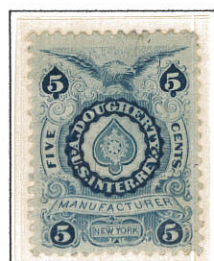
5c blue on silk paper