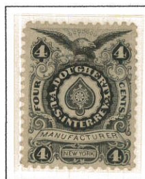
4c black on old paper