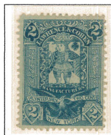
2c blue on old paper