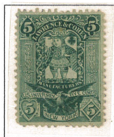
5c green on old paper