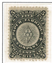
5c black on watermarked paper