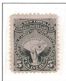
5c black on pink paper