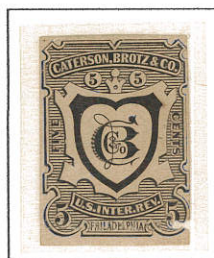
5c brown on watermarked paper