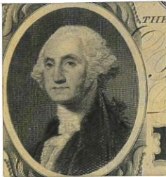
From 1849 New Orleans Canal Bank $5 banknote