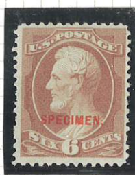
208S SCV 80-