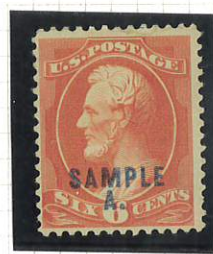
208SL SCV 75-