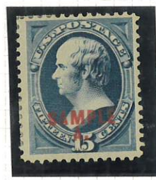
189SL SCV 75-