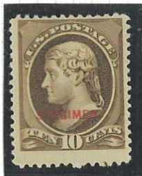
209S SCV 80-