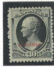
190S SCV 80-