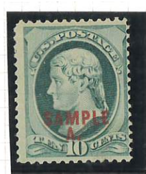
209SL SCV 75-