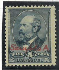
216SN SCV $160-