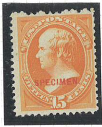
189S SCV 80-