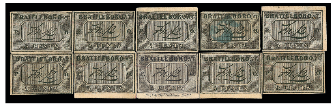
The reconstruction above shows the ten different engraved positions in their respective positions—all but Position 4 come from the sheet retained by the engraver and printer, Thomas Chubbuck, whose imprint appears below Position 8

when the stamps were issued, but it seems likely they were released during the summer of 1846. This issue date is supported by a folded letter dated August 27, 1846, bearing a Brattleboro stamp and the comment "I pay this just to shew you the stamp. It is against my principles, you know." (Siegel Sale 824, lot 15).