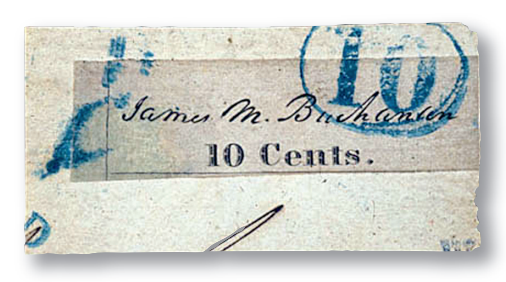
This repaired example of the 10c on Bluish paper is the first Baltimore 10c adhesive discovered

The earliest discoveries of the Baltimore 10c provisional adhesive stamp were made in 1895 and 1896-97. Based on reports published by various writers, it appears that the damaged 10c on Bluish paper, which is tied on piece and repaired (3X4-PCE-02),