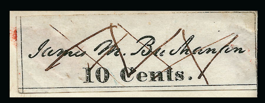
Lot 3 Detail of Stamp