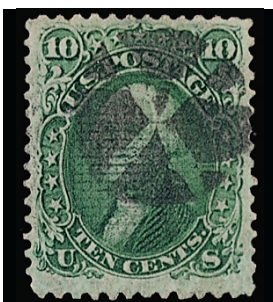
85D-CAN-05 Herzog Coll. RAS 1986 Rarities Zoellner Coll. - RAS Sale 804 10/9/1998 Lot 233 - $80,000 PFC 41751 "Genuine w/ thin spot & small corner crease"