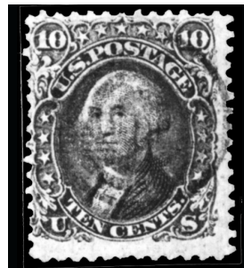
85D-CAN-04 Ishikawa Coll. - Christies 9/1993, Lot 532 - $40,000 PFC 4943 "Genuine" PFC 50292 "Genuine" PFC 276462 "Genuine"