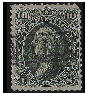
85D-CAN-02 Mielstrup Coll. - RAS 5/23/1973, Lot 150 "trivial corner perf rounding" Isleham Coll. - RAS 5/1986 McNall Coll. - Sup. 10/26/1992 PFC 24671 "Genuine" PFC 259617 "Genuine"