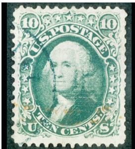
85D-CAN-03 Schilling Coll. RAS 1975 Rarities APS Certificate Illustrated in Brookman Vol. 2, p. 136