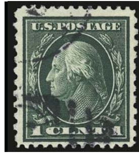
423A-CAN-32 RAS S959, 6/2008, lot 2865 - $9,000 1958 PFC