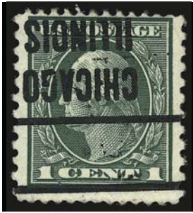
423A-CAN-31 RAS 2008 Rarities, lot 674 - $5,000 2008 PFC

SPECIAL NOTE: There are many United States stamps that look similar to the rarities listed below. Some of the differences between expensive rarities and common stamps can be subtle, including differences in perforation, shade and size. These stamps should have certificates from a recognized expertizing committee, such as The Philatelic Foundation or P.S.E. If you think you have one of these rarities, we cannot help you until after it has such a certificate.