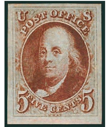
5¢ 1847 Issue (Scott 1), part original gum, graded XF-Superb 95 by PSE

There are two types of mistakes in collecting: one is an error of acquisition, and the other is a missed opportunity. I’ll just talk about errors of acquisition, because they are more likely to cost you money and make you feel like you have fallen hard. Missed opportunities are the regrets of advanced collectors.