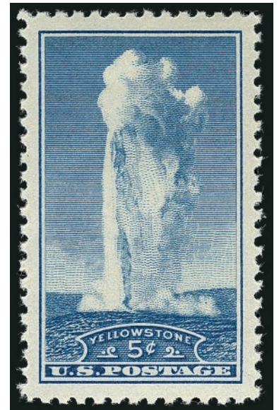
From the 1934 National Parks set—the 5¢ Yellowstone is the first stamp I bought for my childhood collection

I have written this brief guide to stamp collecting, because I know there are people who, just like I did, collected stamps when they were kids and want to start again. Only this time, you have more than your lunch money to spend.