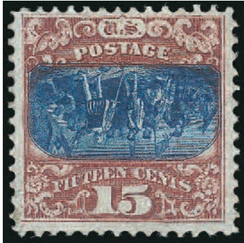
15¢ 1869 Invert (Scott 119b)—the only recorded example with original gum, PSE and PF certificates

Thus, a basic U.S. stamp collection can cost anywhere from $300,000 to more than $10 million. This is why a collector must first determine a personal level of commitment.