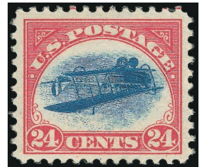
24¢ Inverted Jenny (Scott C3a) Position 58— the only example with a PSE grade of XF-Superb 95 Sold in 2005 for $577,500

The Bechtel scenario is unusual, to say the least. The more typical challenge is creating a realistic collecting strategy that aligns with the limitations of financial capability or commitment. To enjoy stamp collecting, the collector must be able and willing to buy the stamps he wants.