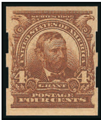
4¢ 1908 Imperforate (Scott 314A)—Mint NH, PF certificate