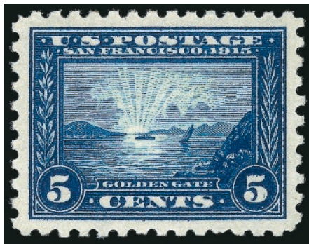
5¢ Panama-Pacific (Scott 403), Mint NH, graded Superb 98 by PSE

An unscrupulous seller who sells Very Fine as Extremely Fine, or hides the fact that a stamp has a thin or has been reperfed or regummed, can turn a $500 stamp into a $2,500 stamp. That is every beginning collector's nightmare: buying something that is not properly and accurately represented.