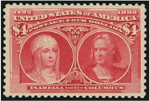
$4 Columbian (Scott 244), Mint NH, graded XF 90 by PSE

An error of acquisition is a bad stamp, a bad price, or both. In stamps, as in life, if a deal looks too good to be true, it ain't.