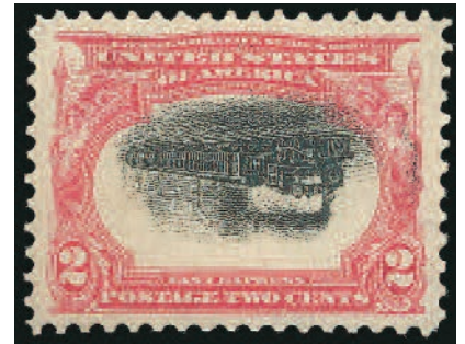
2¢ Pan-American Invert (Scott 295a), original gum, certified Superb 98 by PSE Sold in 2013 for $218,500

I agree that my consignors expect me and my staff to market their stamps to the best of our ability. However, I do not think that prevents us from giving prospective bidders information and substantive opinions. Most of what we have to say about an item is in the sale description. However, how or whether an item fits into your collection and collecting strategy is something we can only say to you, not publish in a catalogue. In that respect, we can be helpful and impartial partners.