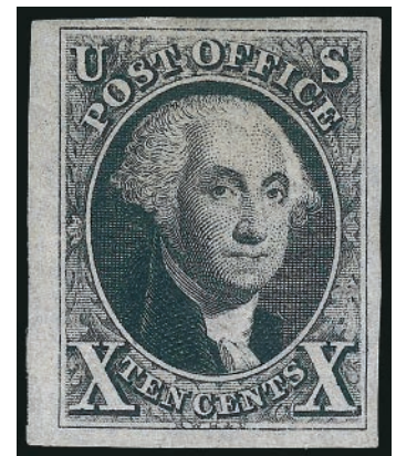
10¢ 1847 Issue (Scott 2), original gum, graded XF 90 by PSE