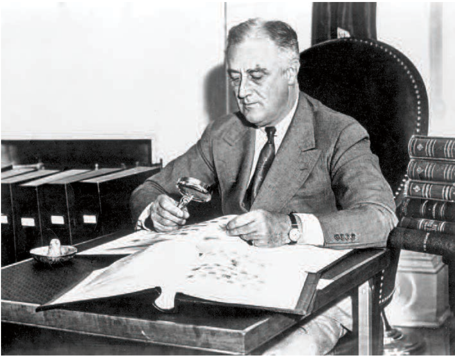
Franklin D. Roosevelt was the nation's presidential philatelist—at right is an absentee bid form he sent to an auction firm in 1935