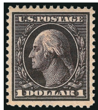
$1 1908 (Scott 342), Mint NH, certified XF-Superb 95 by PSE Sold in 2015 for $6,612